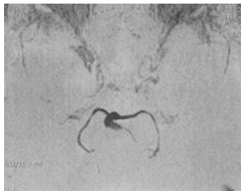
Figure 2. MR angiography demonstrates that there is no flow in either ICA. There is flow in the bilateral posterior cerebral artery and basilar artery.

Bilateral ICA occlusion is known to cause fatal stroke. 1 However, the clinical course of such patients is often chronic, 1 due to collateral circulation, and most strokes result from severe atherosclerosis, 1 arteritis 2 and similar processes. There have been few reports of acute cerebral infarction throughout both ICAs with spontaneous and simultaneous bilateral carotid artery occlusion. To our knowledge, only 2 such cases have been reported previously, excluding trauma or iatrogenic cases. Browne et al 3 reported a case in which an atrial myxoma caused fatal multiple organ embolization that included both ICAs and the cerebellum, heart, kidney, and spleen. Yamaguchi et al 4 reported a case of simultaneous bilateral carotid occlusion. Although they did not observe cerebral infarction on CT scan or MRI, angiography revealed bilateral occlusion of the ICAs. Although postmortem examination did not reveal myxoma, the bilateral ICA was occluded by fresh thrombi at the carotid bifurcation in their case, and they suspected cardiogenic embolism from the clinical course and autopsy findings. It is an undeniable possibility that the cerebral infarction in our patient was caused by dissection of the carotid arteries, either simultaneous and bilateral, or of 1 carotid artery, with the other previously occluded. However, because of the sudden onset stroke attack, history of atrial