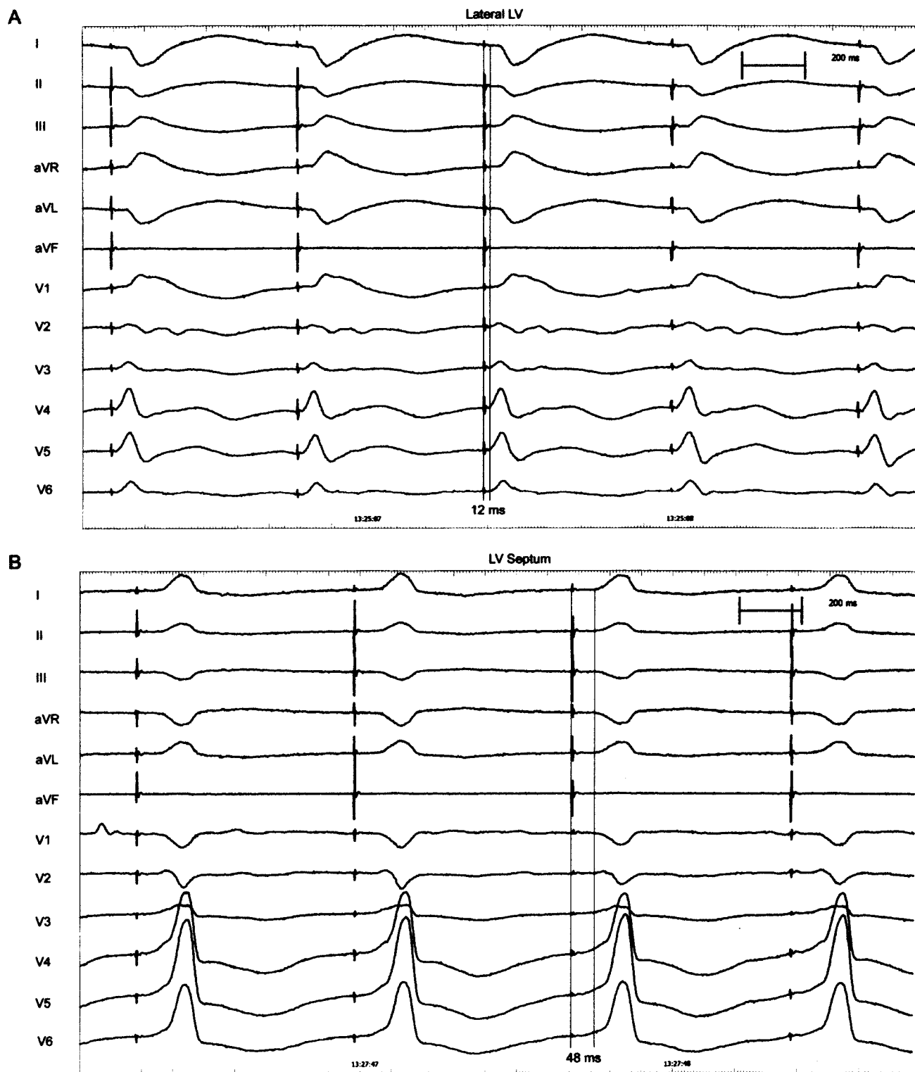
Figure 3. Surface ECG leads during LV stimulation (S1S1, 600 ms) at the lateral LV (A) and hypertrophic LV septum (B). Note that during LV pacing at the lateral LV, a short stimulus-to-V interval was found (12 ms; A), whereas the stimulus-to-V interval was significantly longer (48 ms) in the same patient during pacing at the LV septum (B).

Probably as a consequence of replacement scarring, expanded interstitial fibrosis, and myocardial disarray, the potential analysis of the present study revealed a marked prolongation of the bipolar endocardial potentials and the occurrence of fractionated and split potentials at hypertrophic areas. This finding is in perfect accor-